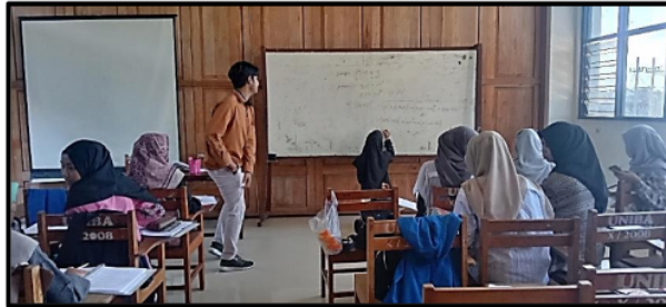
Figure 4. The research subjects were trying to show their performances in front of the class

Presenting the results or performance provided motivation to the research subjects as seen in Figure 4. They looked confident that they were able and had obtained the correct results so that they presented the results on the blackboard (Larmuseau et al., 2019). Conversation 4 with the text in bold and underlined also shows that the research subject has aspects of self-control because he realizes that he had experienced difficulties in doing the work (Apostolou & Linardatos, 2023). The subject also had an aspect of curiosity because he had asked his friends about the answers they had. Interaction with friends as seen from conversation 4 in bold and italic text shows curiosity and adaptivity aspects seen from the research subject.