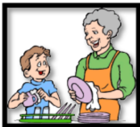
Wash the Dishes