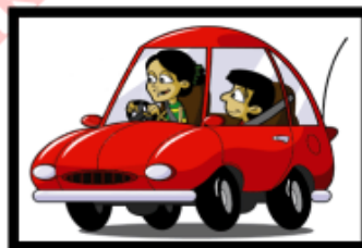
Drive a Car