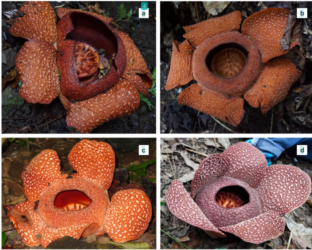
Figure 2 The opening flower of R. zollingeriana at Tempursari, Lumajang (a), Mt. Lincing, Lumajang (b), Meru Betiri National Park, Jember (c), and Papring, Banyuwangi (d); Papring is the only locality where the flower presented imbricate perigone lobes and a thin solid dark orange and white ring at the edge of the diaphragm; the openness of the diaphragm of Papring specimen is smaller than those of the other three localities

the rim of the diaphragm (Figure 3d). Windows absent (Figure 4). Ramenta present from the rim of the lower surface of the diaphragm to the base of the perigone tube (Figure 4), tuberculate up to 4 mm, orange, ramenta with various types of its apex at the inner surface of the diaphragm, deeply lobed ramenta at upper to the mid inner surface diaphragm, 4.1 mm high (Figure 4a), swallowed lobes ramenta, 2.5 cm at the mid diaphragm (Figure 4b), branched ramenta, 3.1 mm, simple tubercle ramenta, 2.02 mm in the upper perigone tube (Figure 4c) simple tubercle ramenta on the lower part of the inner surface of the perigone tube (Figure 4d). Perigone tube 6.6 cm high (Figure 4pg), 17.74 cm wide at its upper tube, and 12.7 cm wide at its base tube. Disc 12.4 cm