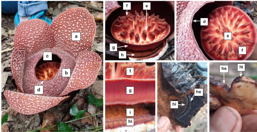
Figure 3 The morphology of the R. zollingeriana from Papring; wart pattern, large warts surrounded by small warts at the centre perigone lobe (a), diaphragm (b), diaphragm aperture (c), solid thin dark orange and white rings at the end of diaphragm rim (d), disc (e), processes (f), disc rim (g), annulus (h), interior annulus (hi), exterior annulus (he), column (i); process truncated cone shape with various blunt spikes at its top (f), interior annulus distinctive raised (hi), exterior annulus indistinctively developed (he)

high, 5.80–6.31 mm at its apex, 6.21–6.52 mm at its base (Figure 3f). Column 5.02 cm high, 4.7 cm wide at its upper part, 6.3 cm wide at its base, hairy grooves with 2.7–3.4 mm wide running down from the anther sac to the annulus interior (Figure 3i). Annulus interior distinctively well-developed, 2.98 mm high, 3.01 mm wide at its base (Figure 3hi), indistinctively developed annulus exterior less than 1.72 mm, 5.4 mm wide at its base (Figure 3he). Anther 32, anther cavities with dense hair.